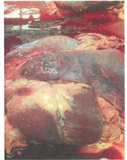
Heart and lungs from a cow with heart failure due to ionophore toxicosis. The lungs have a wet appearance compatible with pulmonary edema.

One consistent mistake made by cattle producers is offering a medicated mixing mineral to cattle free-choice. “Mixing minerals” containing ionophores are designed to be mixed in at least 1 pound of non-medicated feed before offering to cattle daily to control intake. In addition, the label clearly states cattle should receive no more than 100 mg/head/day contained in not less than 1 pound of feed for the first 5 days of feeding. “Free choice” products, on the other hand, are formulated specifically to limit intake and reduce the risk of overconsumption. The feeding directions on the label should be followed carefully and all cautions observed. Cattle can eat enough medicated mineral to cause intoxication, especially when offered concurrently with ionophore-medicated feeds. The potential also exists for overconsumption of monensin when a new bag of medicated mineral is offered if cattle are salt-deprived, either due to prolonged periods without access to minerals or if the available mineral has hardened due to excess moisture and is difficult to consume. Additionally, excessive rain on exposed mineral can dissolve and leach away salt, increasing the concentration of the remaining ionophore. Careful use of the correct product, reading label ingredients and recommendations, and feeding in weather-protected feeders will help prevent problems.