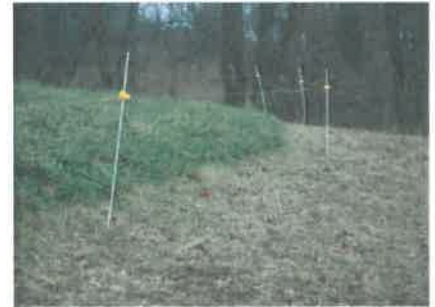
Figure 1. Strip grazing stockpiled grass can extend grazing by as much as 40%.