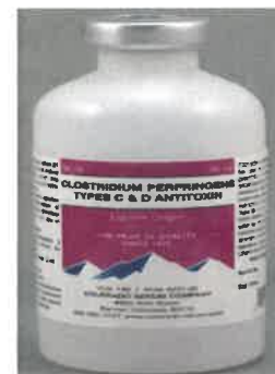
Figure 2: Retrieved from https://colorado-serum-com.3dcartstores.com/cd-antitoxin

Commercially available vaccines have also been designed to be administered to the newborn calf for protection from certain viruses. Calf-Guard®, manufactured by Zoetis, is an older product that contains attenuated (modified live) strains of bovine rotavirus and bovine coronavirus. It can be administered either by injection to a pregnant cow within four weeks of calving or to newborn calves by mouth before nursing to help protect calves from scours caused by rotavirus or coronavirus. A brand-new product, Bovilis® Coronavirus (Merck), is an intranasal vaccine administered to healthy calves 3 days of age and up to reduce the duration and severity of diarrhea due to bovine coronavirus (Figure 1). To protect against Clostridium perfringens Type C, Colorado Serum Company produces a C. perfringens Types C & D antitoxin (Figure 2) labeled for prevention lasting approximately 3 weeks after 10 ml administration SQ at birth. However, there is limited availability of this product because of stringent testing requirements in equine donor animals as this product is made from equine serum.