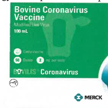
Figure 1: Retrieved from https://www.merck-animal-health-usa.com/species/cattle/products/bovilis-coronavirus

First Defense® makes their products by collecting antibody-rich colostrum that is purified and concentrated, then standardized to guarantee antibody levels for each dose. These antibodies bind directly to bacterial and viral antigens, ideally before they can enter and harm cells in a calf's gut. These are not vaccines, so the calves are not required to trigger an immune response for protection. Although these antibodies will provide immediate protection in the gut, they are much more effective when given at the same time as good quality colostrum. Be aware of the label claims when using First Defense products (see Table 1); not all pathogens are covered by every product. First Defense® Tri-Shield® gel offers the broadest coverage, specifically aiding in the reduction of mortality (death) and morbidity (sickness) from scours caused by E. coli K99 and coronavirus while also reducing the severity and duration of scours caused by rotavirus. Interestingly, the First Defense® gels have an added blue dye that renders the calf feces green, allowing the producer to know the gel has gone through the calf's GI tract. For an economical option, First Defense® offers a nutritional supplement powder with the same ingredients as the boluses, and it is shelf stable in a resealable bucket. One level scoop is mixed with fresh or thawed colostrum until completely dissolved and then fed to the newborn calf.